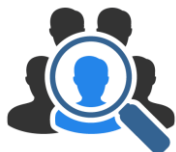
On-Roll / Off Roll Recruitment