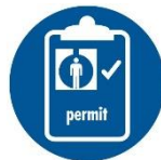
Work Permit Ready Resources