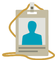
On-site Resource Placement

We can help you in minimizing your recruitment costs if you are seeking candidates from India or from the UK / Europe. Finding & recruiting the right candidate with the right experience for an ICT profile is not easy, we bridge the gap by understanding your requirements, identifying & short listing right candidates for you. The candidate can be directly hired by you on your payroll or can be outsourced from Global KPO.